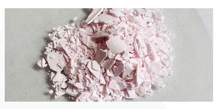
Figure 1 | Jupiter's >99.9% pure sample of High Purity Manganese Sulphate

Jupiter has successfully produced a >99.9% pure sample of High Purity Manganese Sulphate Monohydrate – referred to as "HPMSM" or battery grade manganese – with Tshipi ore and utilising an internally developed hydrometallurgical production process (see photo at Fig. 1 to the right).