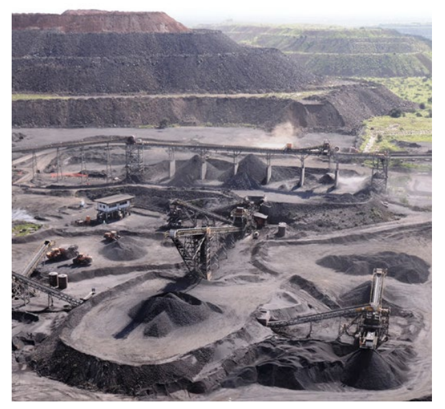
Figure 4 | Tshipi Manganese Mine, South Africa

Tshipi has been in production since 2012 and has more than 100 years of mine life remaining.